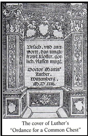
The cover of Luther's "Ordinance for a Common Chest"